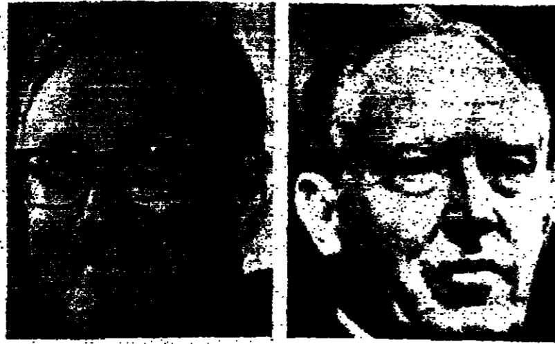
Kissinger... the 'maker of foreign policy'... Rogers... 'not left out in the cold.'